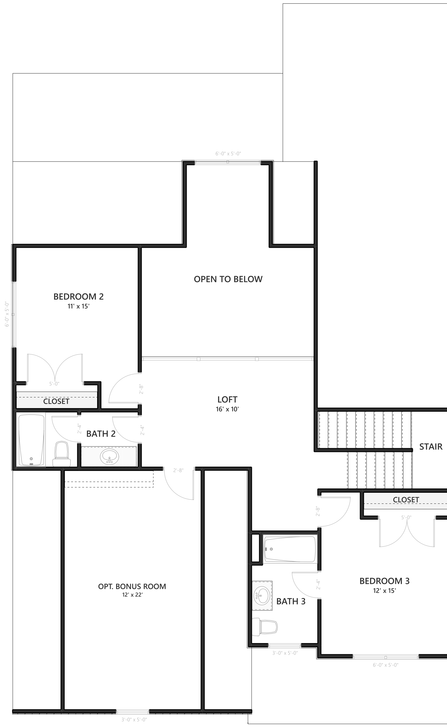
UPPER LEVEL ELEVATION A 641 HEATED SQ FT